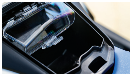
Front Storage and Watertight Phone Compartment A front storage for easier access to bring more gear on board. Easily secure cell phone and valuable items with the watertight phone compartment.