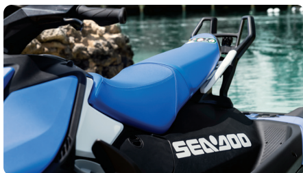
Slim Seat Designed to improve freedom of movement while riding.