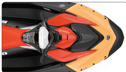
LinQ™ Lite Integration Quickly accessible and located at 5 points of the unit. Array of Sea-Doo® LinQ™ Lite accessory range.