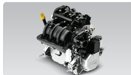
ROTAX® 900 ACE™ - 60 Two fuel-efficient, compact and lightweight Rotax® engine options.