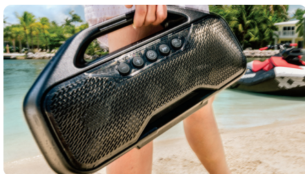
BRP Audio - Portable System (optional) The BRP audio-portable system provides higher quality sound on and off the water featuring Concert, Ride and Home mode. Equipped with a heavy duty mounting bracket.