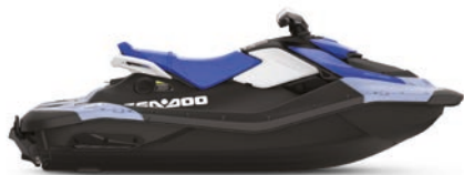
● NEW Dazzling Blue and Vapor Blue