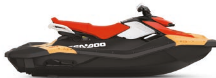
● NEW Sunrise Orange and Dragon Red