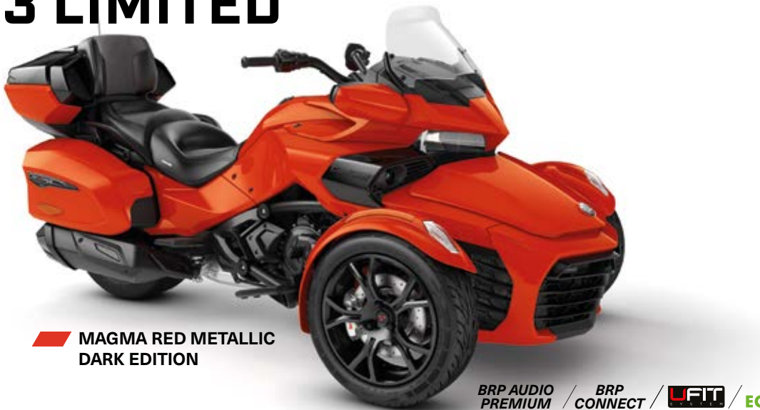
SPYDER F3 LIMITED