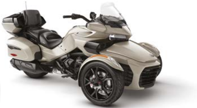
LIQUID TITANIUM DARK EDITION