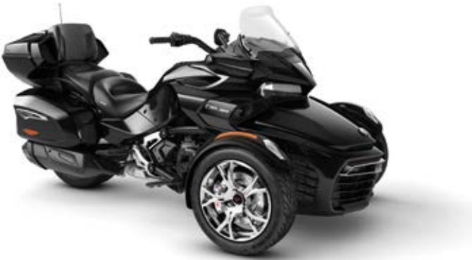
STEEL BLACK METALLIC* CHROME EDITION * Parts and trims available in Chrome or Dark Editions