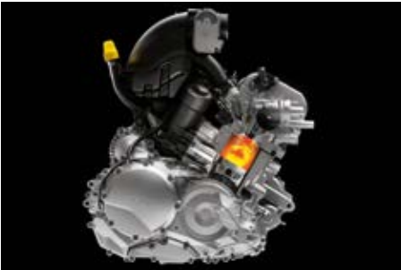
ROTAX 1330 ACE ENGINE 115 hp engine – More power can only mean one thing – better performance. Our most powerful engine allows you to challenge the road knowing you have the horsepower you want when you need it.