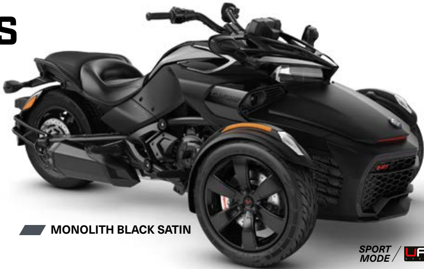
MONOLITH BLACK SATIN