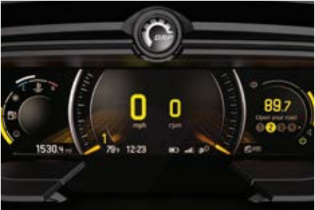
DIGITAL GAUGE Large panoramic 7.8" wide LCD color display on Special Series.