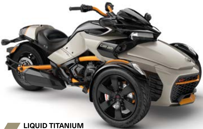
LIQUID TITANIUM SPECIAL SERIES