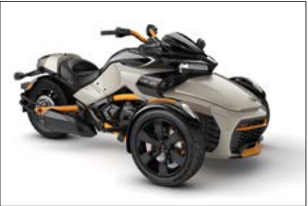
SPECIAL SERIES A special package for the sport enthusiasts that comes pre-equipped with several accessories.