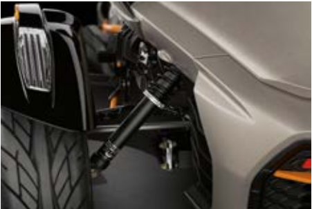
FOX' SHOCKS Sport-tuned, gas-charged front shocks give you a responsive, sporty feel and great performance on the most demanding roads.