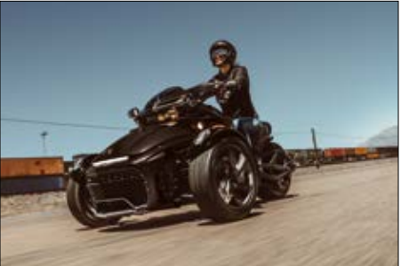
VSS Vehicle Stability System that uses a variety of technologies, including SCS / ABS / TCS, to monitor the vehicle and keep the rider confident on the road.