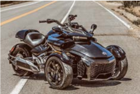
VSS Vehicle Stability System that uses a variety of technologies, including SCS / ABS / TCS, to monitor the vehicle and keep the rider confident on the road.