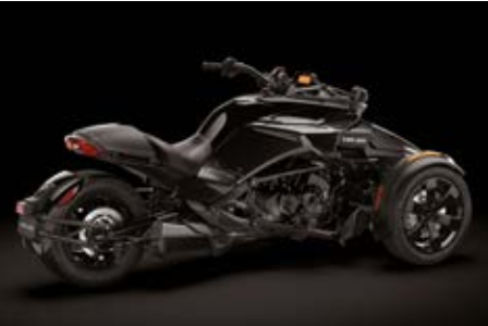
Y ARCHITECTURE Two wheels in front means better handling and enhanced stability.