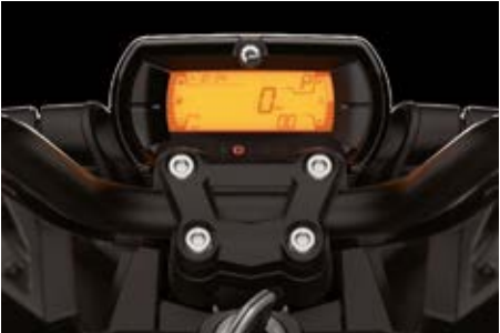
DIGITAL GAUGE 4.5" digital display with a minimalist design to see everything you need.