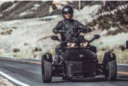
SEMI-AUTOMATIC TRANSMISSION Shift through gears easily with the touch of a button.