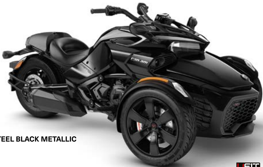
STEEL BLACK METALLIC