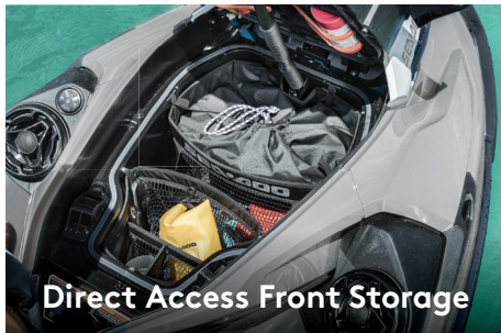
Direct Access Front Storage

Large front storage area that's easily accessible from a seated position. 1 Storage bin organizer included for ultimate convenience.