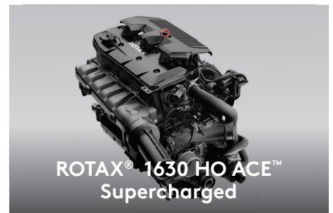
ROTAX® 1630 HO ACE™ Supercharged

Waterproof and shockproof compartment specifically designed for phone protection. 2