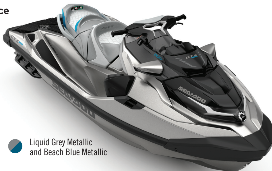
Liquid Grey Metallic and Beach Blue Metallic