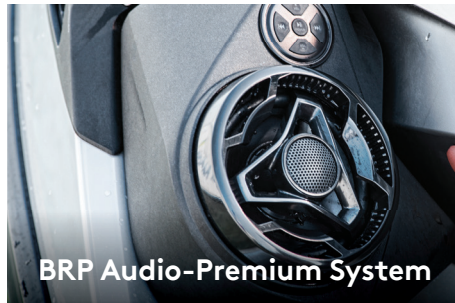
BRP Audio-Premium System

Large front storage area that's easily accessible from a seated position. 1 Storage bin organizer included for ultimate convenience.