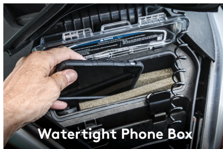
Watertight Phone Box

An innovative hull that sets the benchmark for rough water handling, stability, and offshore performance.