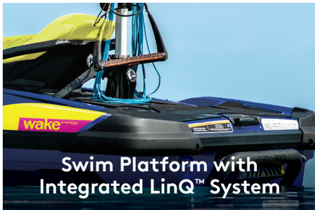
Swim Platform with Integrated LinQ™ System

Exclusive quick-attach system on the largest swim platform in the industry that allows for easy installation of accessories. 1