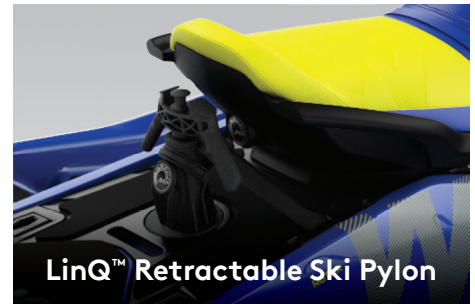
LinQ™ Retractable Ski Pylon

The industry-first manufacturer-installed, truly waterproof, Bluetooth ® audio system. 2