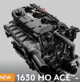
NEW 1630 HO ACE™ - 170

The new Rotax® 1630 HO ACE™ - 170 is the most powerful naturally aspirated Rotax engine ever on a Sea-Doo watercraft.