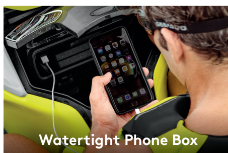
Watertight Phone Box

The industry-first manufacturer-installed, truly waterproof, Bluetooth® audio system. 2