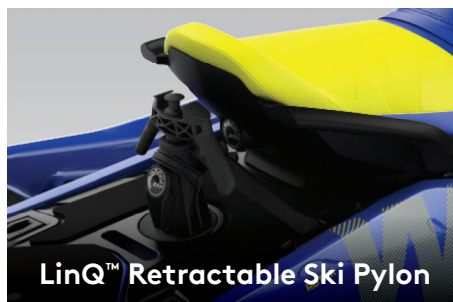
LinQ™ Retractable Ski Pylon

The new Rotax® 1630 HO ACE™ - 170 is the most powerful naturally aspirated Rotax engine ever on a Sea-Doo watercraft.