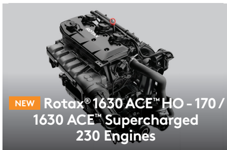
NEW Rotax® 1630 ACE™ HO - 170 / 1630 ACE™ Supercharged 230 Engines

An industry-first manufacturer-installed, truly waterproof, Bluetooth ‡ audio system. 2