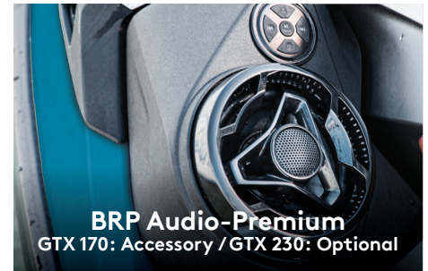
BRP Audio-Premium GTX 170: Accessory / GTX 230: Optional

Exclusive quick-attach system on the largest swim platform in the industry that allows for easy installation of accessories.