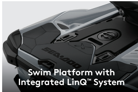
Swim Platform with Integrated LinQ™ System

Large front storage area that's easily accessible from a seated position. 1