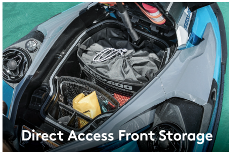
Direct Access Front Storage

Large front storage area that's easily accessible from a seated position. 1