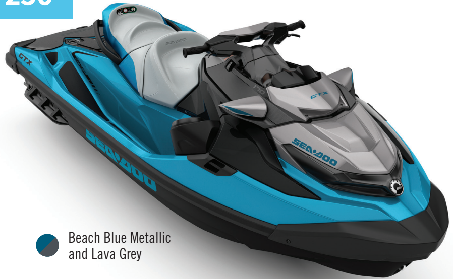
Beach Blue Metallic and Lava Grey