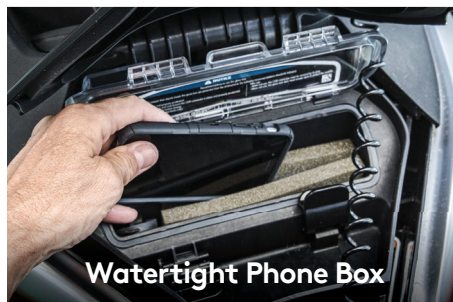
Watertight Phone Box

The Rotax® 1630 ACE™ Supercharged 230 offers instant acceleration by way of a powerful supercharger, while the new Rotax® 1630 ACE™ HO - 170 is the most powerful naturally aspirated Rotax engine ever on a Sea-Doo.