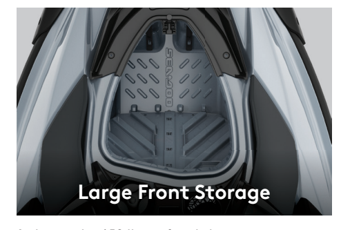
An impressive 152 liters of sealed storage space allows riders to safely stow belongings while riding.