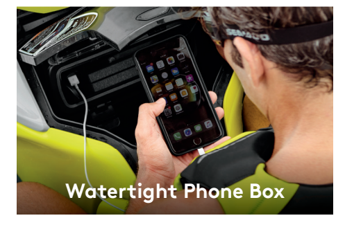
Waterproof and shockproof compartment specifically designed for phone protection.