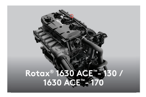
The new Rotax 1630 HO ACE engine is the most powerful naturally aspirated Rotax engine ever on a Sea-Doo watercraft.