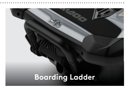
Makes boarding from the water easier and quicker.