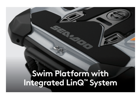
Exclusive quick-attach system on a large swim platform that allows for easy installation of accessories.