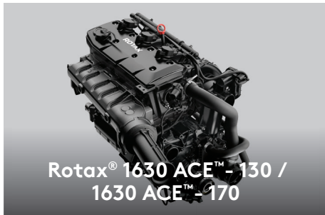
Rotax® 1630 ACE™ - 130 / 1630 ACE™ - 170

The new Rotax 1630 HO ACE engine is the most powerful naturally aspirated Rotax engine ever on a Sea-Doo watercraft.