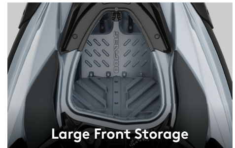
Large Front Storage

Exclusive quick-attach system on a large swim platform that allows for easy installation of accessories.