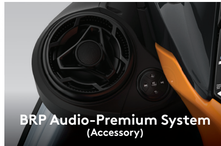
BRP Audio-Premium System (Accessory)

The new Rotax 1630 HO ACE engine is the most powerful naturally aspirated Rotax engine ever on a Sea-Doo watercraft.