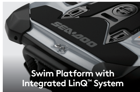
Swim Platform with Integrated LinQ™ System

Waterproof and shockproof compartment specifically designed for phone protection.