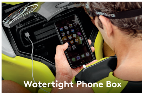
Watertight Phone Box

Makes boarding from the water easier and quicker.