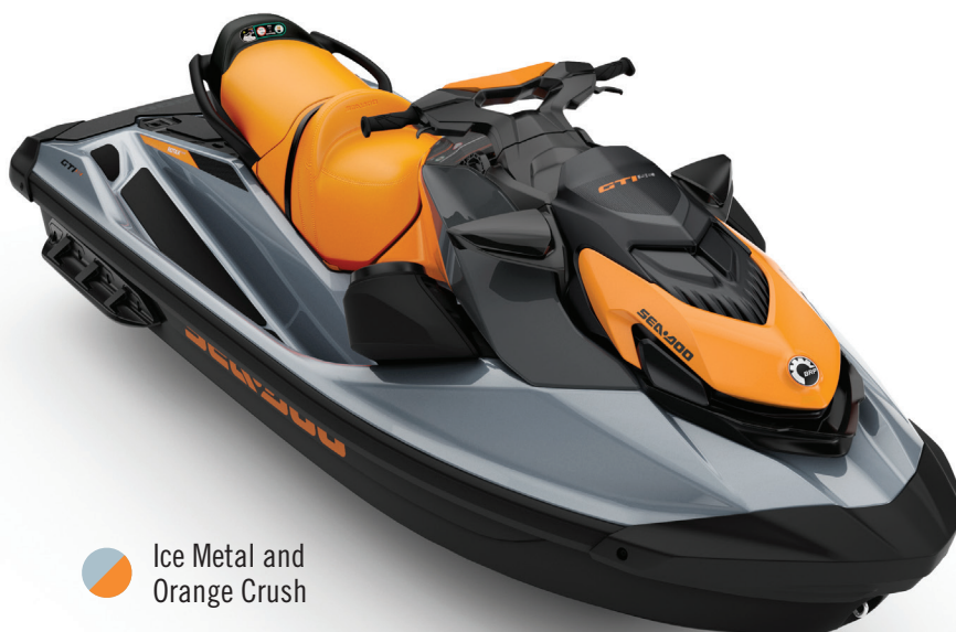
Ice Metal and Orange Crush