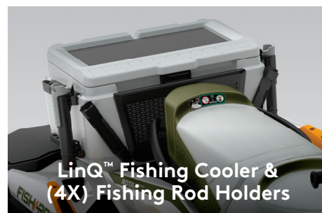
LinQ™ Fishing Cooler & (4X) Fishing Rod Holders

Optimized for ease of movement around the entire watercraft, and for better comfort and stability when facing sideways.