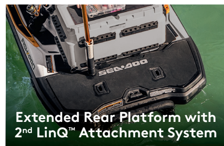
Extended Rear Platform with 2nd LinQ™ Attachment System

A spacious, quick-attach fishing cooler designed for easy access and equipped with numerous convenient features.