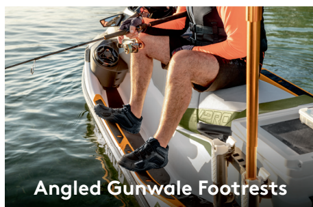
Angled Gunwale Footrests

Adds 29 cm to the back of the watercraft to increase stability, space, and storage capability.