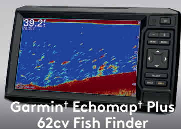
Garmin† Echomap† Plus 62cv Fish Finder

A top-of-the-line navigation, charting and fish-finding system using CHIRP technology for high definition images.