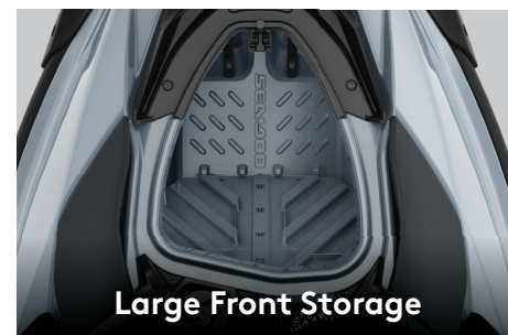
Large Front Storage

The Rotax® 900 ACE™ - 90 gives crisp acceleration with impressive fuel economy and for those who want added performance, the extra horsepower of the 1630 ACE™ - 130 is all about fun and acceleration.