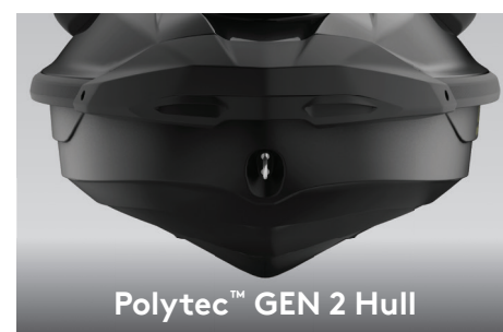
Polytec™ GEN 2 Hull

This exclusive Sea-Doo® feature optimizes power output for up to 46% improved fuel efficiency. 1