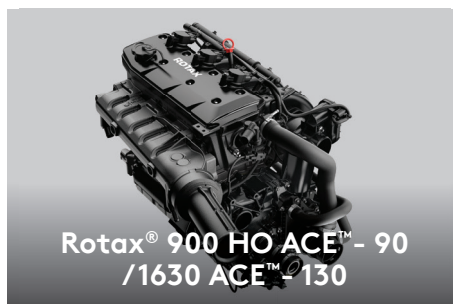
Rotax® 900 HO ACE™ - 90 / 1630 ACE™ - 130

Exclusive to Sea-Doo®, iBR® stops the watercraft sooner and provides more control and maneuverability at low speeds and in reverse.