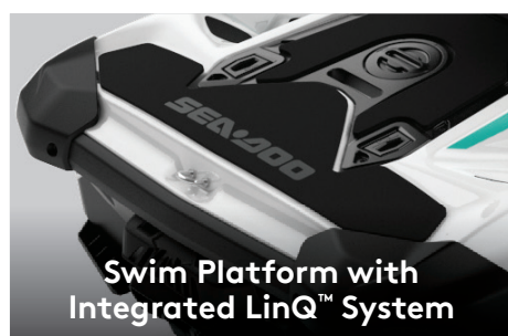
Swim Platform with Integrated LinQ™ System

An impressive 152 liters of sealed storage space allows riders to safely stow belongings while riding.