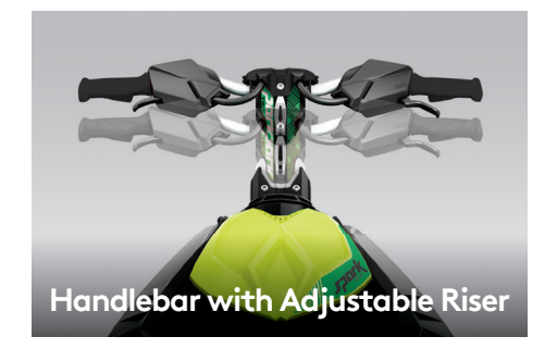
A telescopic steering system that optimizes the experience for varying rider sizes.