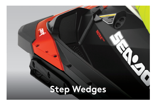
Provides enhanced stability and confidence in different riding positions making it easier to pull off tricks like a pro.