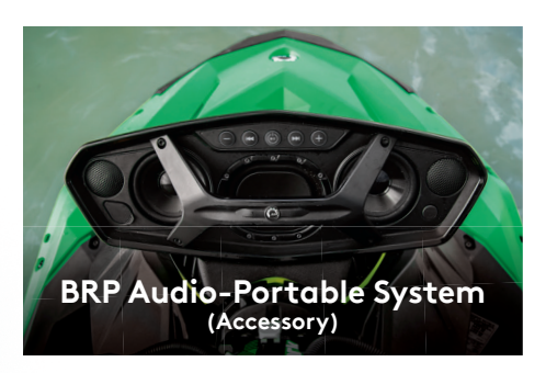
High-quality, waterproof 50-watt Bluetooth \!\!\!^{\ddagger} portable sound system.