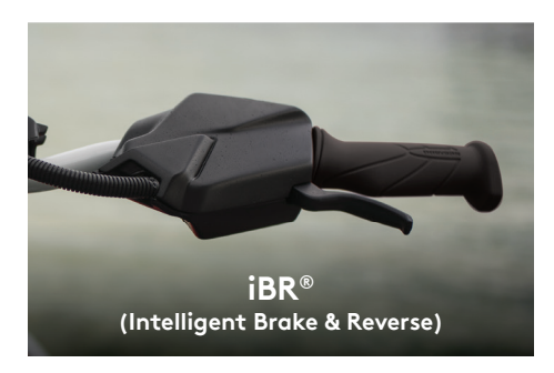
Exclusive to Sea-Doo®, iBR® stops the watercraft sooner and provides more control and maneuverability at low speeds and in reverse.