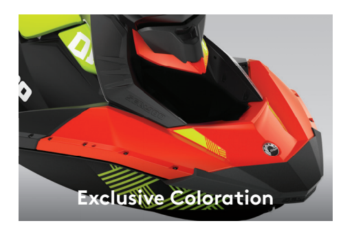
Exclusive TRIXX^{TM} coloration.