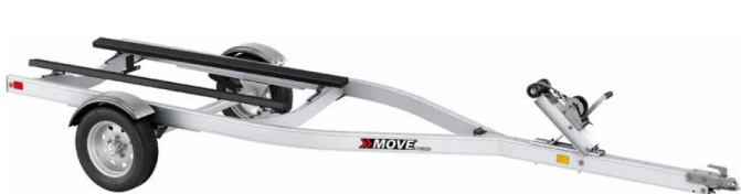
Aluminum MOVE I Extended 1250