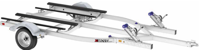
Aluminum MOVE II