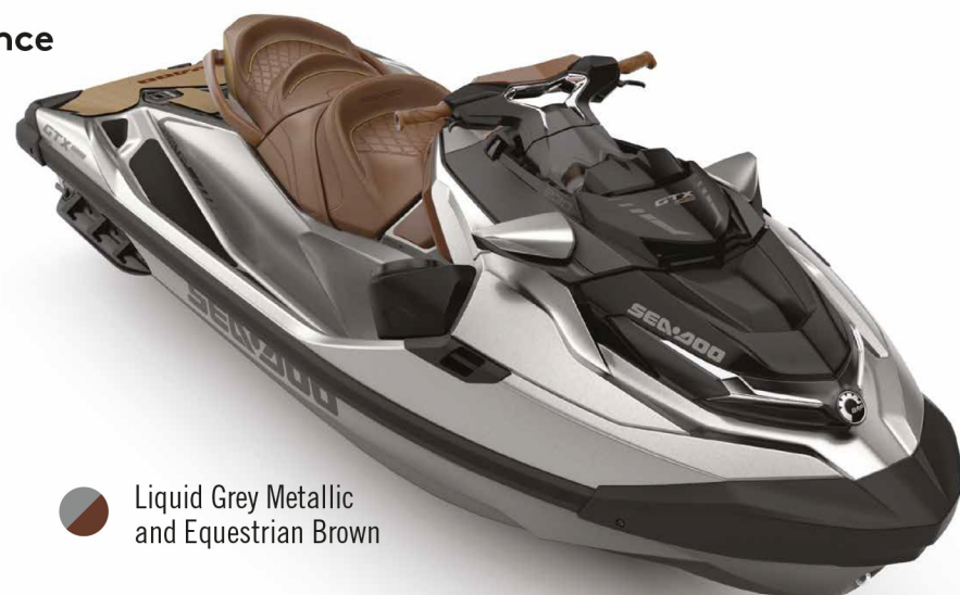
Liquid Grey Metallic and Equestrian Brown