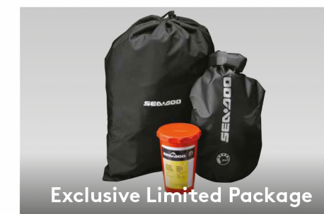
Exclusive Limited Package

An innovative hull that sets the benchmark for rough water handling, stability, and offshore performance.