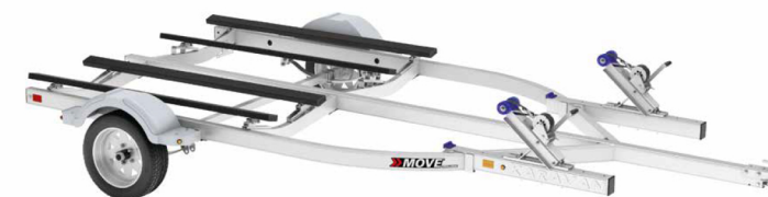
Aluminum MOVE II