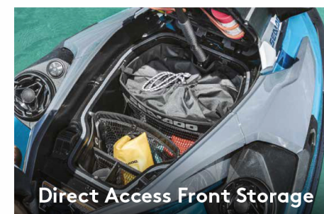
Direct Access Front Storage

Large front storage area that's easily accessible from a seated position. 1