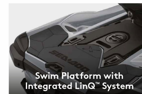
Swim Platform with Integrated LinQ™ System

The industry's first manufacturer-installed, truly waterproof, Bluetooth 2 audio system.