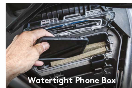
Watertight Phone Box

Exclusive quick-attach system on the largest swim platform in the industry allows for easy installation of storage accessories.