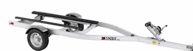
Aluminum MOVE I Extended 1250