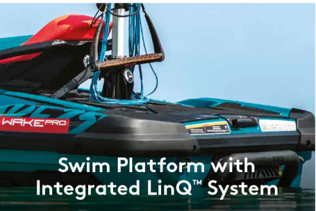
Swim Platform with Integrated LinQ™ System Exclusive quick-attach system on the largest swim platform in the industry that allows for easy installation of accessories. 1