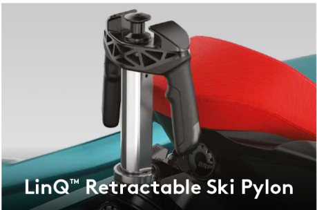
LinQ™ Retractable Ski Pylon A quick install retractable ski pylon that stows away when not in use. Features spotter handgrips and rope storage.