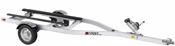
Aluminum MOVE I Extended 1250