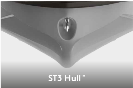
ST3 Hull™ An innovative hull that sets the benchmark for rough water handling, stability, and offshore performance.