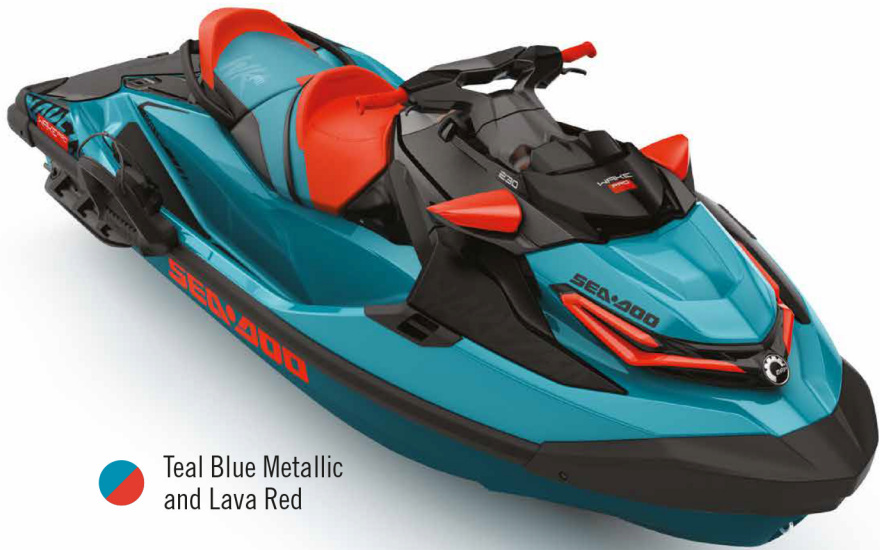
Teal Blue Metallic and Lava Red