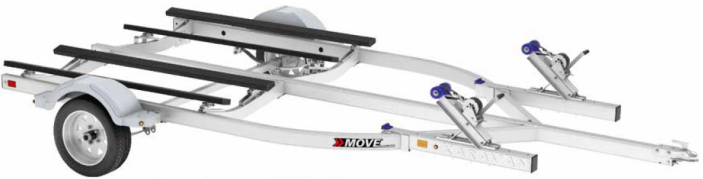
Aluminum MOVE II