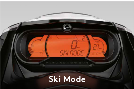
Ski Mode Five preset acceleration profiles make it easy to deliver a smooth launch and maintain consistent pace.