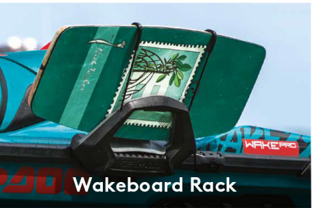
Wakeboard Rack Provides easy transport of a wakeboard. 3