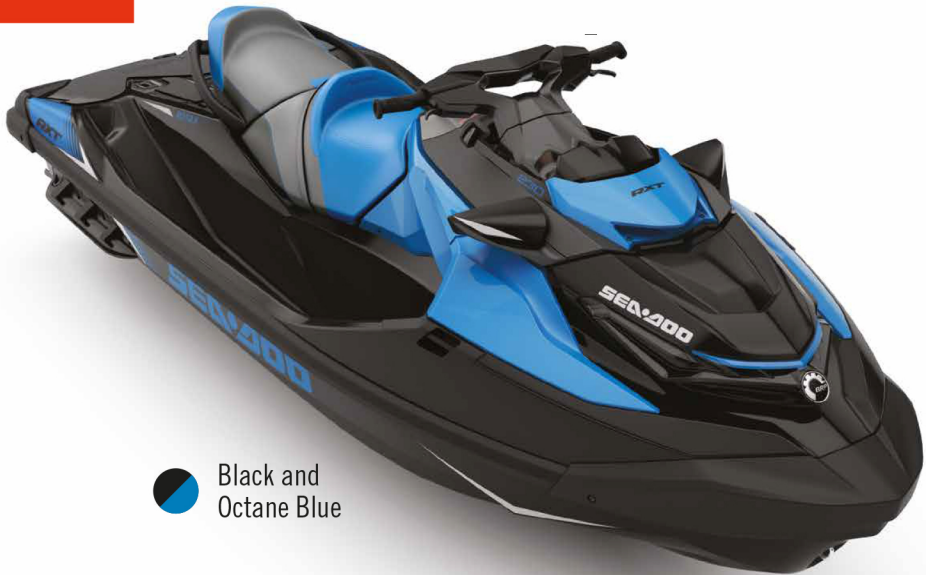
Black and Octane Blue