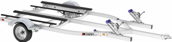
Aluminum MOVE II