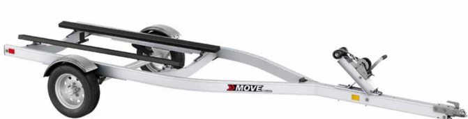
Aluminum MOVE I Extended 1250