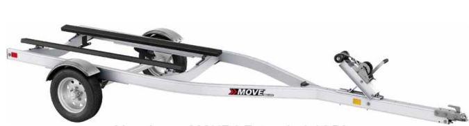
Aluminum MOVE I Extended 1250