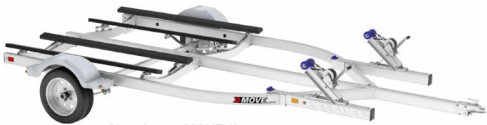
Aluminum MOVE II