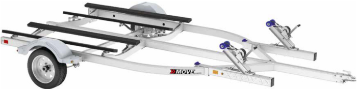
Aluminum MOVE II